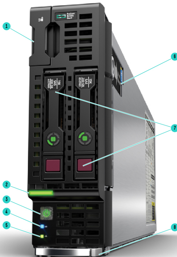
HPE ProLiant BL460c Gen10 Server Blade – Front View

Scale business performance and securely drive Traditional and Hybrid IT workloads across a converged infrastructure with the new HPE ProLiant BL460c Gen10 server blade for HPE BladeSystem. The HPE ProLiant BL460c Gen10 server blade helps drive new applications, turbo charge performance and transform into an agile, secure foundation, which with HPE OneView, places you on the path to Composable Infrastructure.